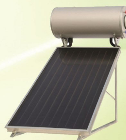
SECUterm 160 Ltr.