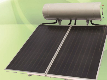
SECUterm 300 Ltr.

Please call us for an appointment with no obligation